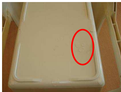
No manufacturer’s name or other marks, just 5 raised points