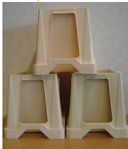
Packaging color differs (underneath: pirated)